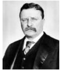
Theodore Roosevelt 1907

"In the first place, we should insist that if the immigrant who comes here in good faith becomes an American and assimilates himself to us, he shall be treated on an exact equality with everyone else, for it is an outrage to discriminate against any such man because of creed, or birthplace, or origin. But this is predicated upon the person's becoming in every facet an American, and nothing but an American... There can be no divided allegiance here. Any man who says he is an American, but something else also, isn't an American at all. We have room for but one flag, the American flag... We have room for but one language here, and that is the English language... and we have room for but one sole loyalty and that is a loyalty to the American people."