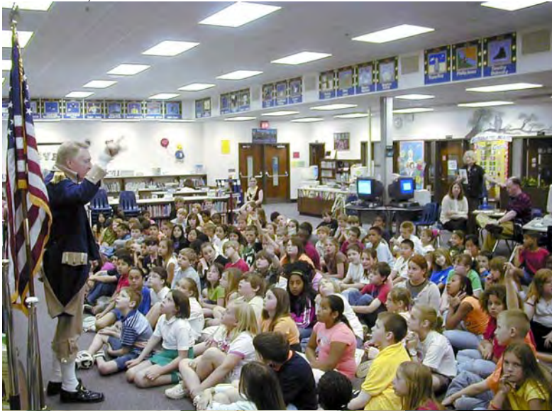
Lewis Elementary school provided a big crowd for their April 26 gathering.