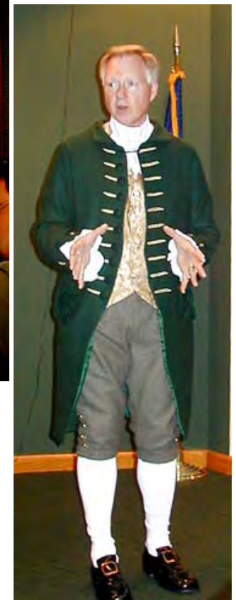
The Friends of the Smyrna Library meeting May 18th was an opportunity to present 'Spies of the Revolution' to an attentive audience of about 15, including potential members!