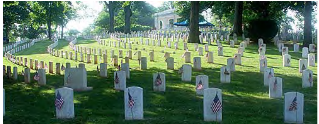
Memorial Day at the Marietta National Cemetery begins with the placement of 18,000 flags by over 1600 scouts on the Saturday before the national holiday.