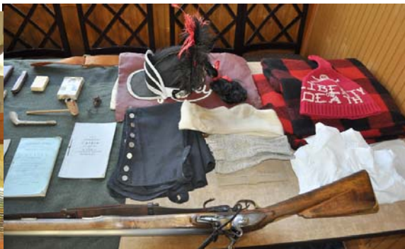
Clothing and personal effects of a Colonial era soldier.