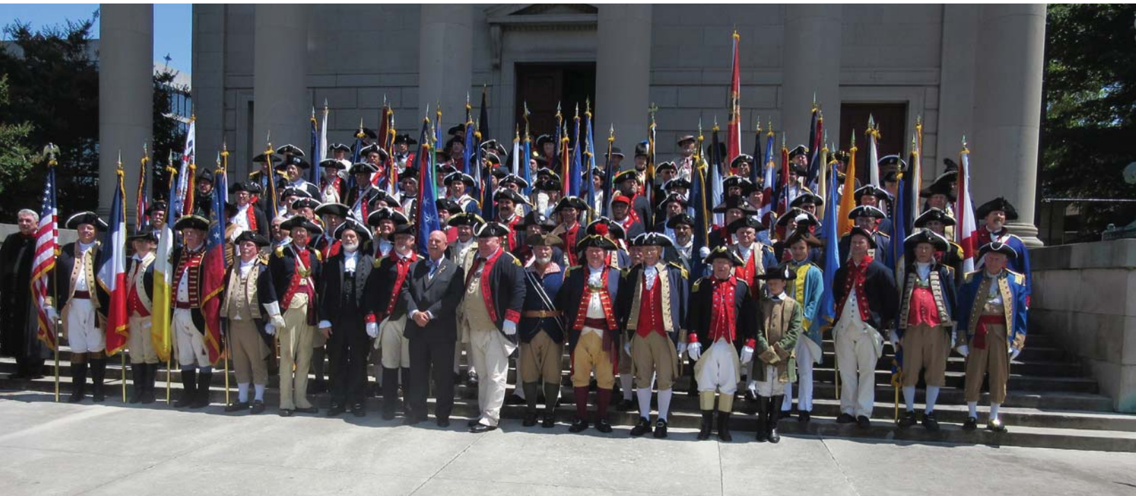
The Color Guard for the 127th Annual Congress in front of the First Baptist Church, Knoxville, TN.

The Chapter Renewal process is here. Your 2018 Membership dues are now being collected. Now is the time to write and mail your check. Dues not paid by December 31st means that you become inactive and must be reinstated to be current.