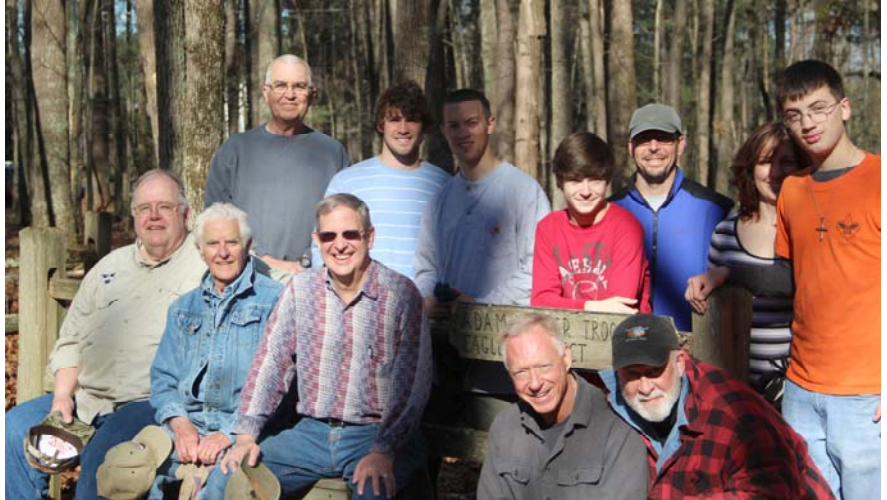
Members were assisted by scouts from Troop 540 in the clean up of the Old Allatoona Cemetery on April 6th.