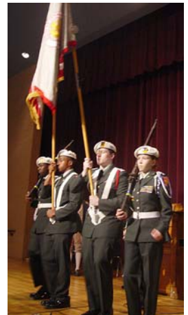
Douglasville High School Color Guard