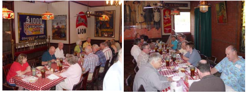
Spaghetti Warehouse Meeting location attendees in August

Phone: 678-860-4477 Fax: 678-443-8992 Email: lg_adjservices@mindspring.com