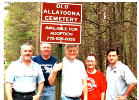
1st cemetery cleanup crew 2001

We also assisted the Piedmont Chapter on