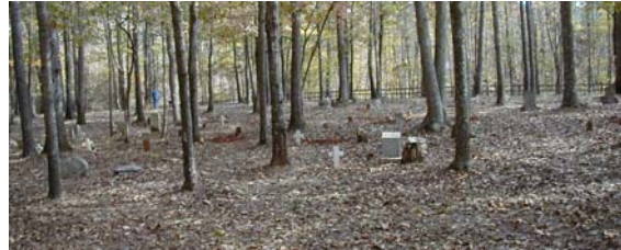
Old Allatoona Cemetery during Chapter cleanup. Many hands make the job much easier Join us in Spring

Chapter Website http://www.captainjohncollins.org