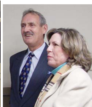
Collins Annual Banquet January 16, 2007